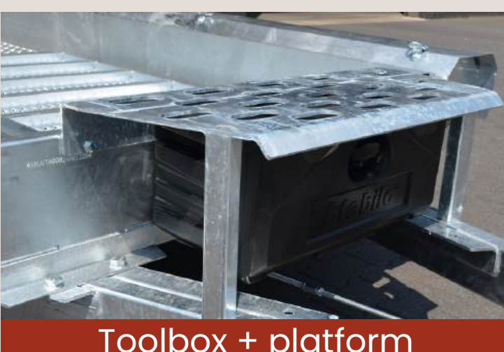
Plastic tool box